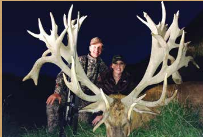
647 SCI Rifle Kelsey, Texas