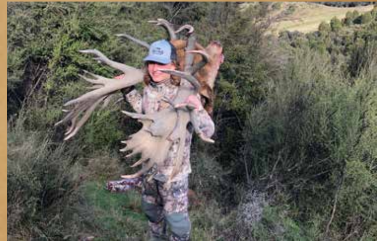
617 Archery Hayden, Oregon